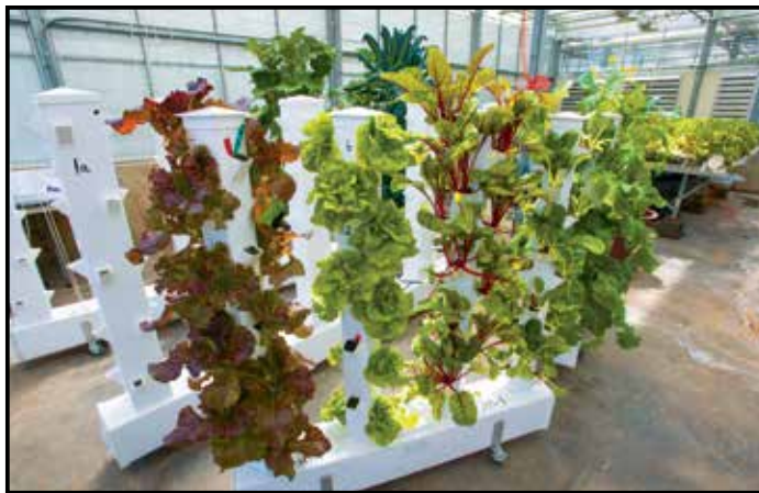
Vegetables growing in aeroponic vertical gardens.

For information on CASE and links to majors and other information about SEBS and Rutgers, visit our website at sebs.rutgers.edu/academics/case.html .