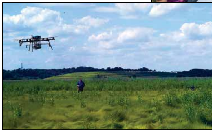
Drone, applying liquid larvicide to control mosquitoes.