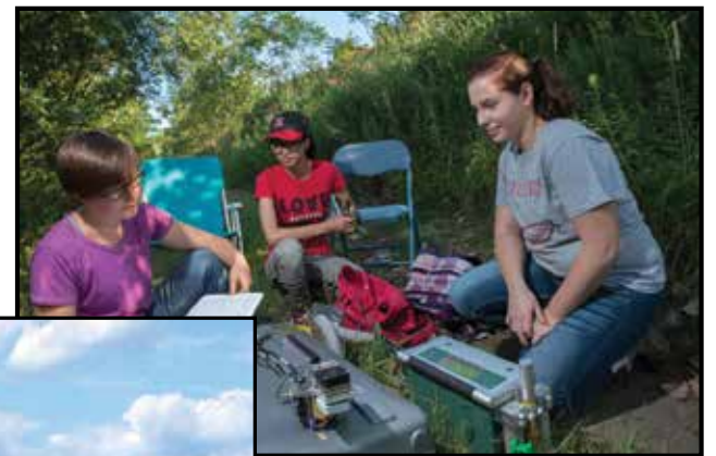
Summer research at Liberty State Park.